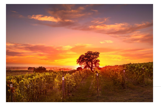
Vineyards in Bolgheri during Sunset with Tree in Background