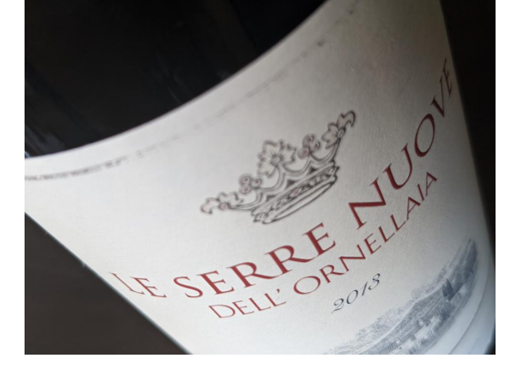
2013 Le Serre Nuove dell'Ornellaia CATHRINE TODD

August saw significantly lower temperatures which favored aromatic expression and led to a later than average harvest. This wine was going through a tight phase and so it took several hours for it to open and Axel noted that this is a more retrained, linear profile of Serre Nuove although he expects the wine to evolve past this stage. Granite and tar on the nose with dark fruit brooding in the background and spice on the extremely focused finish.