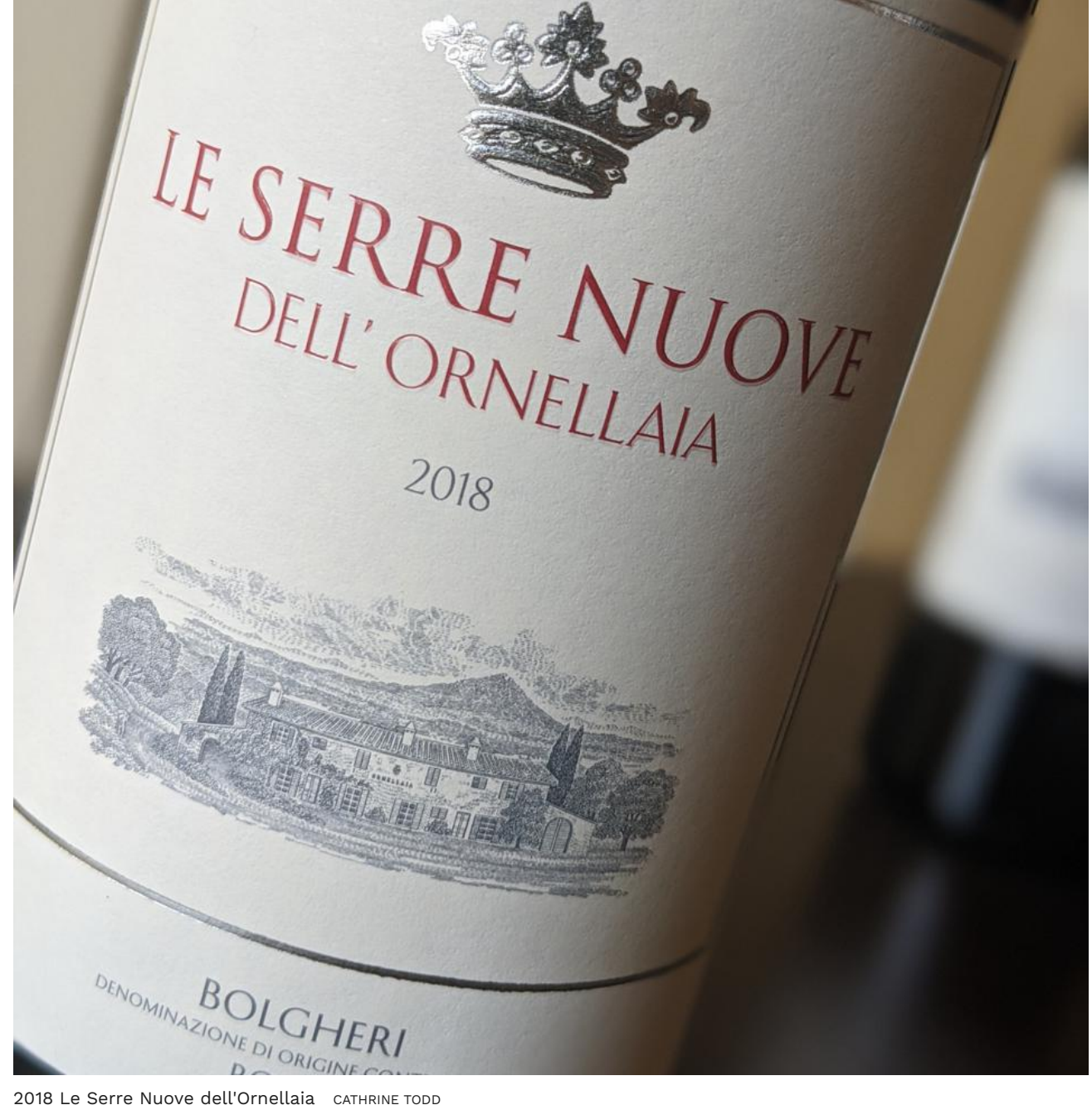
2018 Le Serre Nuove dell'Ornellaia CATHRINE TODD

2018 Le Serre Nuove dell'Ornellaia, Bolgheri Rosso DOC, Tuscany: 33% Cabernet Sauvignon, 32% Merlot, 18% Cabernet Franc and 17% Petit Verdot. "2018 is a slightly more balanced blend where none of the grape varieties completely sticks out but you can definitely feel a strong presence of both Cabernet varieties in this wine," stated Axel. 2018 was not a hot or cool vintage overall as it was fairly warm for most of the year with no heat spikes and a good amount of rain. A beautifully aromatic wine with floral and fresh red raspberry notes that had a fine texture with crisp acidity and lovely balance of sweet fruit and savory dried herbs.