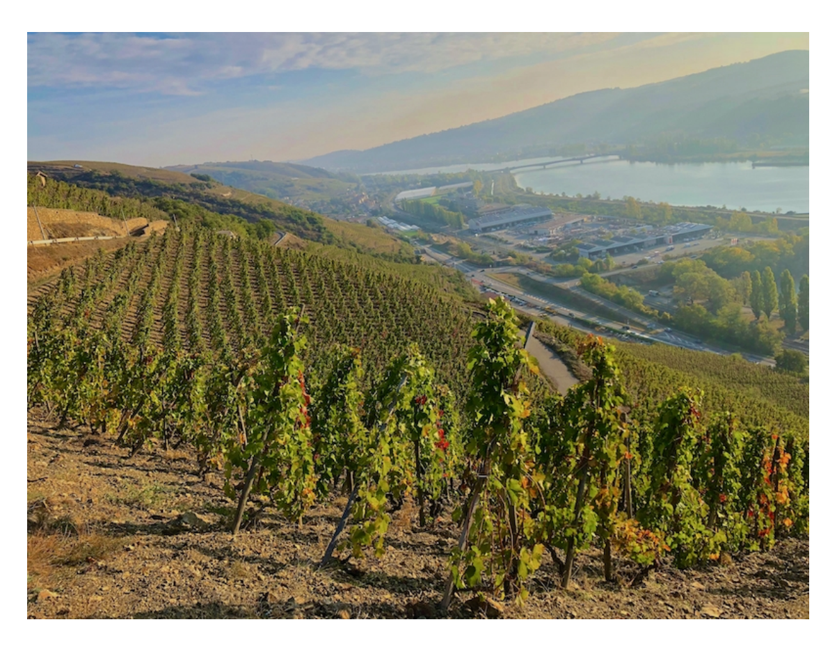
A parcel in northern La Landonne

Workers start at the bottom of the hill and climb upward, as it's easier to see the grapes from below than above.