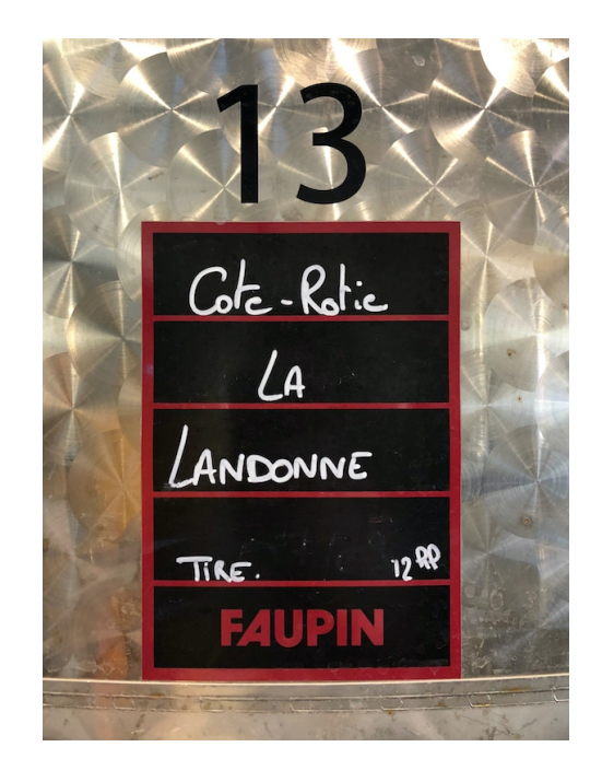
Gerin's tank of La Landonne

Approaches to vinifying La Landonne vary dramatically among the vignerons who bottle vineyard-designate wines. The most distinctive is that of Guigal, an intentional decision on Marcel's part, knowing that unlike his monopole La Mouline, he'd eventually be joined by other growers and needed a way to differentiate his expression of the site. Marcel fashioned a series of square stainless steel tanks that he filled to the brim with whole clusters. A grid separates the grapes from a second smaller vat nested on top, and a column brings the must from the lower to the upper tank, allowing for continuous pumping over the course of fermentation and maceration, which lasts for approximately four weeks. The result is some combination of carbonic maceration and