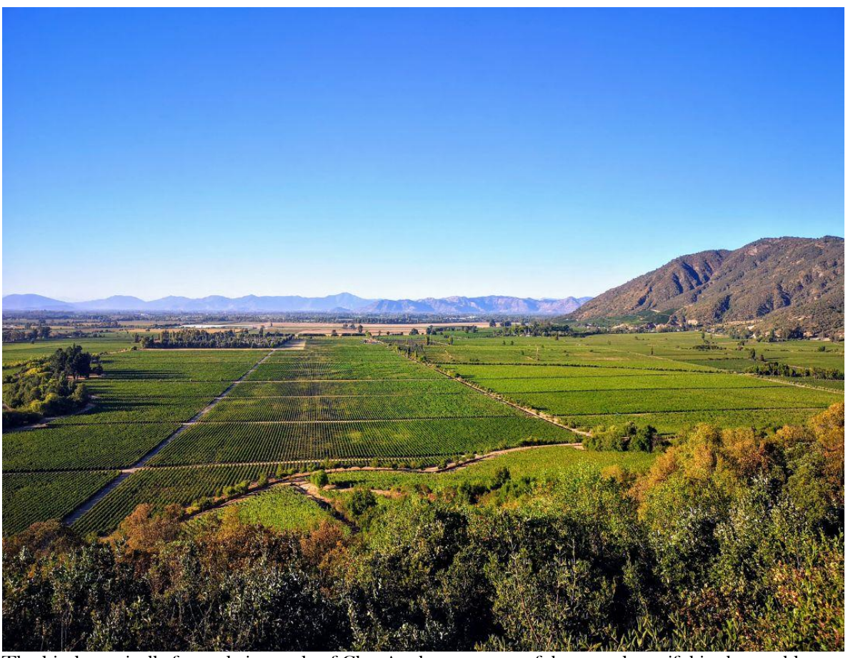
The biodynamically farmed vineyards of Clos Apalta are some of the most beautiful in the world.

As I pass through the dusty vineyards of three of Chile's most famous wineries - Almaviva, Don Melchor and Vinedo Chadwick - I feel like I am travelling through some of the best places in Bordeaux, perhaps Haut-Brion or La Mission Haut-Brion. It's not only the urban features that surround the vineyards in Puente Alto that seem similar to these legendary Bordeaux chateaux. It's also the intense awareness of place and reputation you feel, knowing that tens of thousands of great bottles of red are made here each year. This region in the suburbs of Santiago is ground zero for the best Chilean wines, many of which I have rated 100 points over the years. And that makes it the key inspiration for the excitement much of the world has for Chilean wines today, especially in Asia.