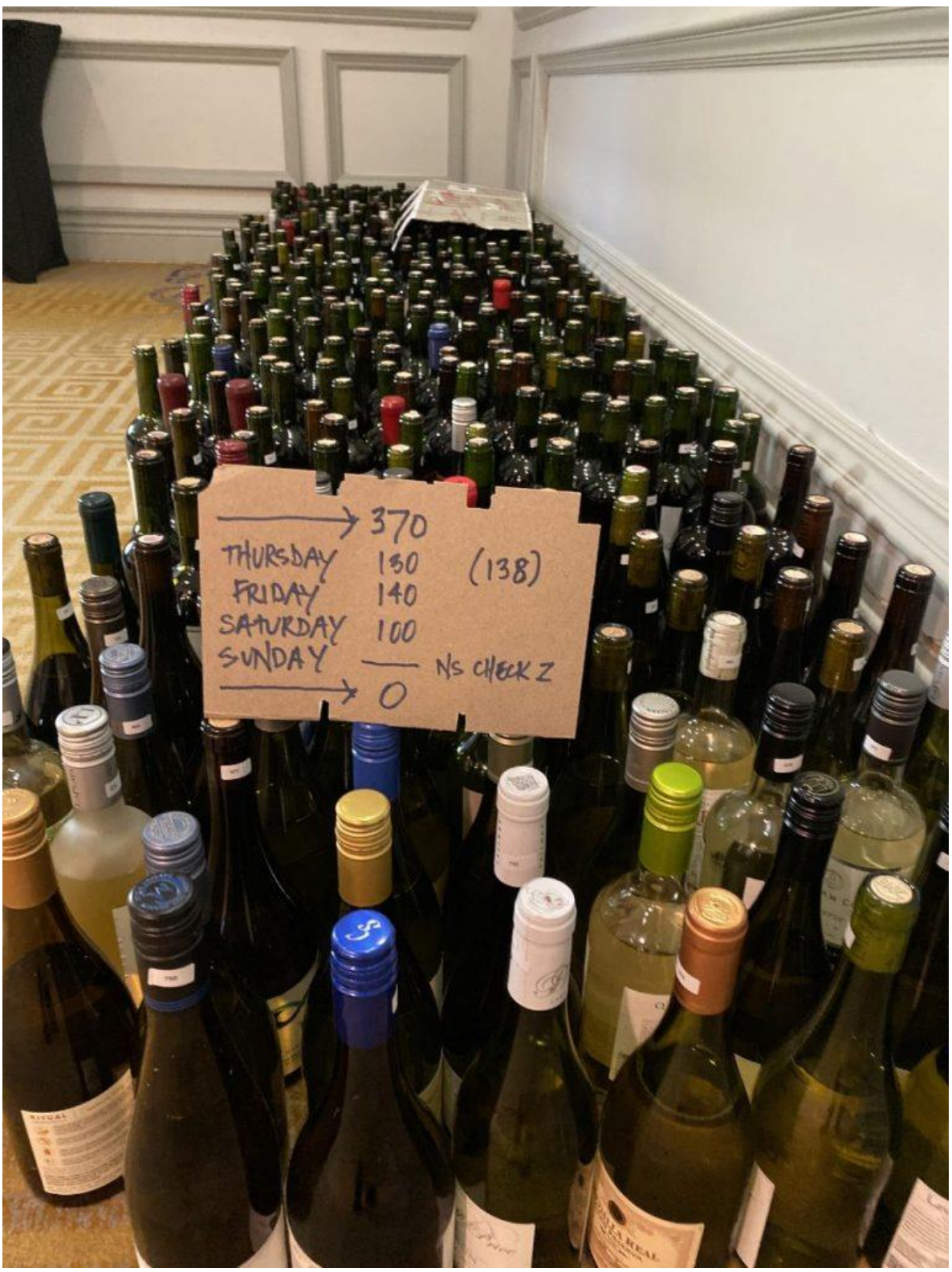
The tasting check list in Santiago at the hotel where the JamesSuckling.com team stayed.

And so this year we had a key question in mind as we toured through the country in February: would more producers both large and small be making world class wines now? Would the average quality of Chilean wines increase? Would we find more classic quality wines rated 95 points or more?